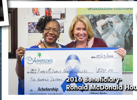
2016 Beneficiary- Ronald McDonald House